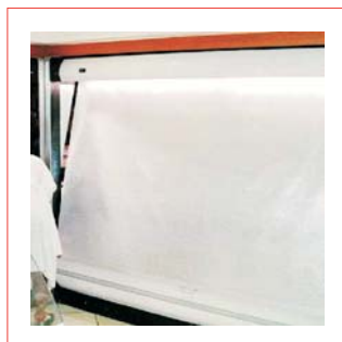
Roller Blind in Aluminium Housing